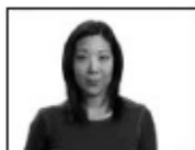
Google Privacy: A Look at Cookies