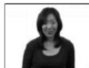
Google Privacy: Third Party Ad Serving Basics, Part 3