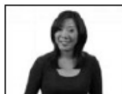
Google Privacy: Third Party Ad Serving Basics, Part 1