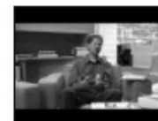
Cookies - Google Privacy Tips