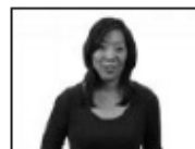
Google Privacy: Third Party Ad Serving Basics, Part 2