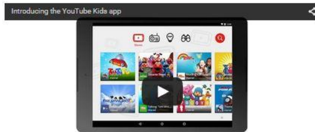
Introducing the new YouTube Kids app

Today, we're introducing the YouTube Kids app, the first Google product built from the ground up with little ones in mind. The app makes it safer and easier for children to find videos on topics they want to explore, and is available for free on Google Play and the App Store in the U.S.